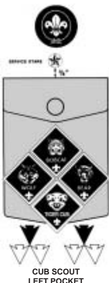
CUB SCOUT LEFT POCKET