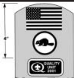
WEBELOS SCOUT RIGHT SLEEVE